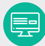
UI & FORMS